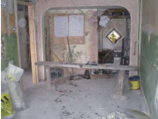
Replacement and refurbishment of kitchen