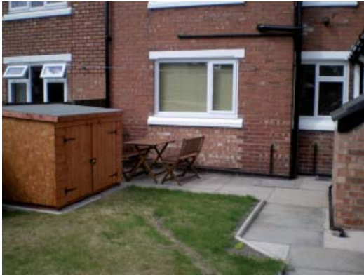
Typical garden - with bike shed, barbeque, garden chairs and maintained garden