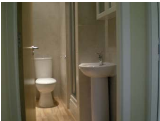
Additional toilet, with shower and sink