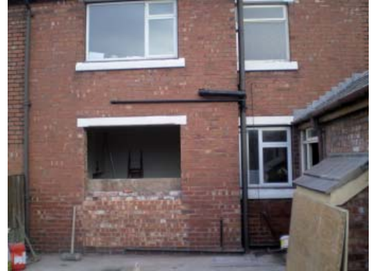
Redesign of garden and building structure