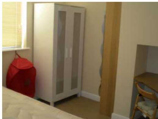
Bedroom - comprising; bed, wardrobe, desk, internet access, drawers, mirror and laundry basket