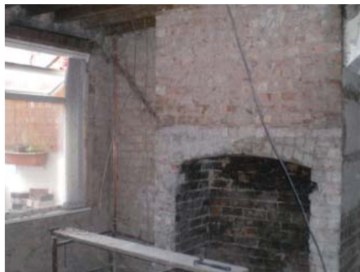
Removal and opening chimney stacks