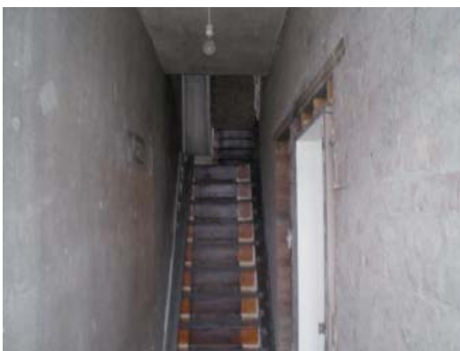
Removal of all plaster - insulation added - fully rewired and replumbed